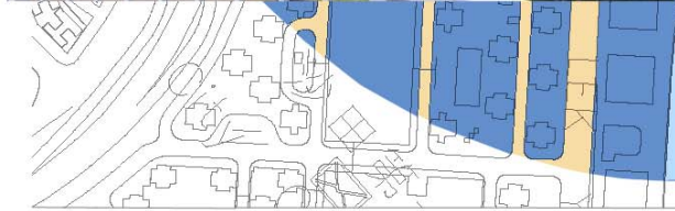
LCA7 - River Channel