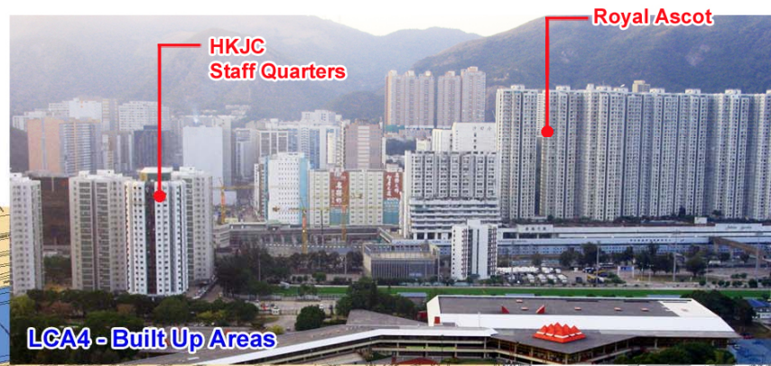
LCA4 - Built Up Areas