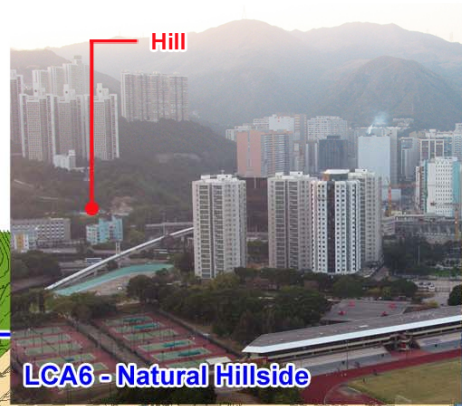
LCA6 - Natural Hillside